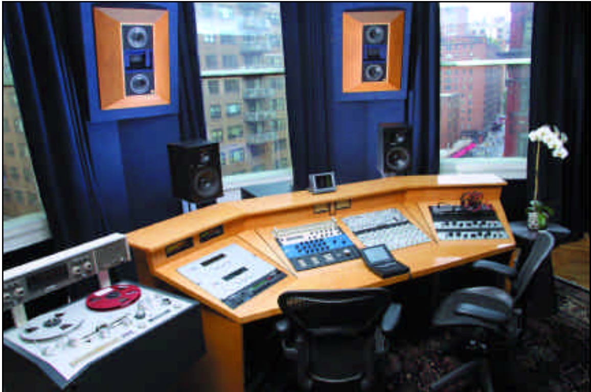
THE LODGE : MASTERING ROOM