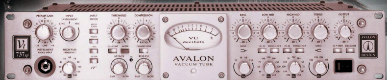
VT-737SP Mono vacuum tube preamplifier, opto-compressor and discrete, Class A four-band equalizer. Unlimited rich sound loaded with sonic character, ideal for direct to tape, DAW and digital recording. $2,295

Avalon truly sets the pace... absolutely brilliant!"