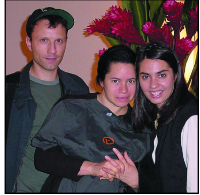
NATALIE MERCHANT & TODD VOS (PRODUCER)