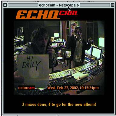
SONIC YOUTH VIA CYBERSPACE