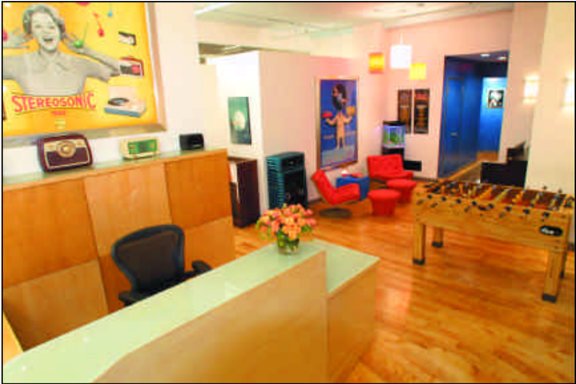
THE LODGE : MAIN FOYER