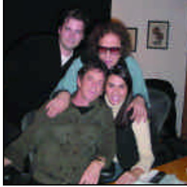
LOU REED