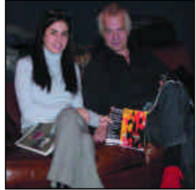
TONY VISCONTI (PRODUCER)