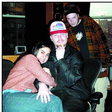
EL-P (DEF JUX) & NASA