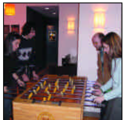
THE APPLES IN STEREO