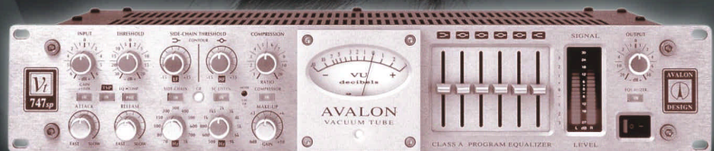
VT-747SP Stereo vacuum tube opto-compressor with LF and HF spectral side-chain control, discrete Class A six-band program equalizer and tube bypass. Excellent for stereo buss compression, audio sweetening and mastering. $2,495